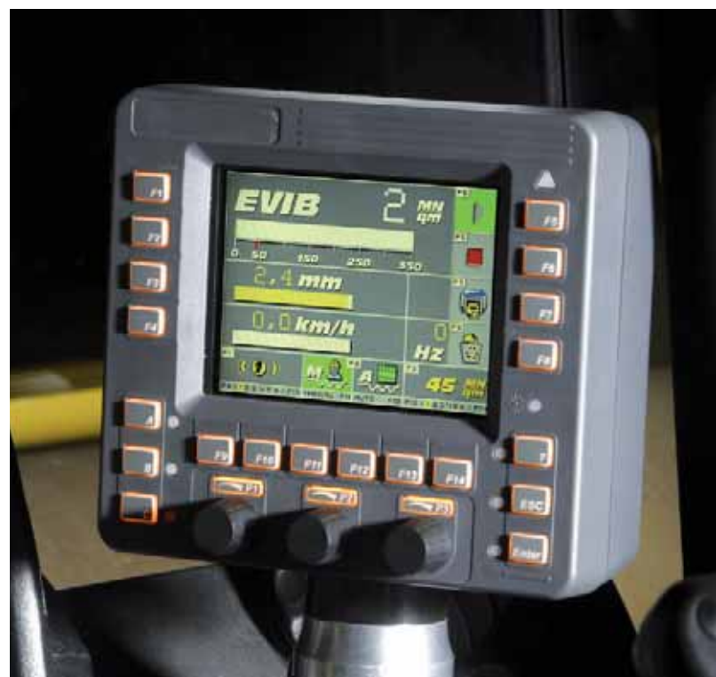
The clear screen display (differs from the BW 177 BVC design) tells the driver when optimum compaction is reached.

In automatic mode the maximum amplitude can be limited. This function is particularly useful when working on thin layers (e.g. frost blankets), as the roller will only compact down to the desired depth and so achieves a uniform density.