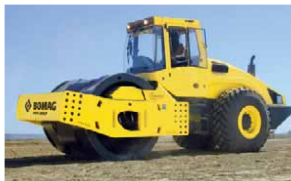
BW 226 DI BVC with polygonal drum.