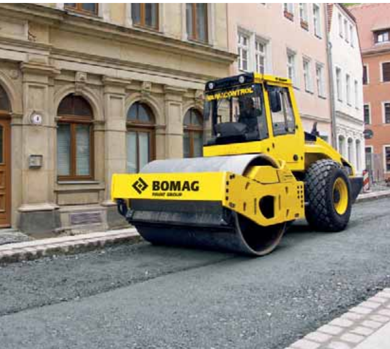
BOMAG single drum rollers with BVC: equally suited to urban use as to heavy-duty applications such as rockfill.

VARIOCONTROL on BOMAG single drum rollers automatically optimises compaction forces in response to the current soil status. The stiffness of the soil under the drum is measured many times a second. These results then serve as the basis in calculating the force needed to achieve optimum compaction.