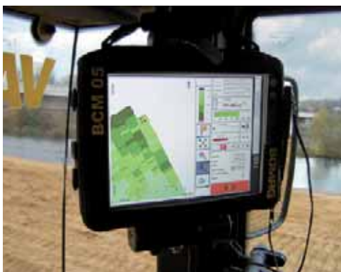
BCM 05 – Complete map-style documentation of compaction.