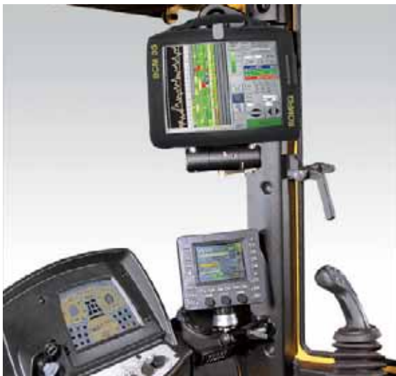
Compaction is now fully under control – BOMAG measuring technology, easy to operate and centrally controlled.