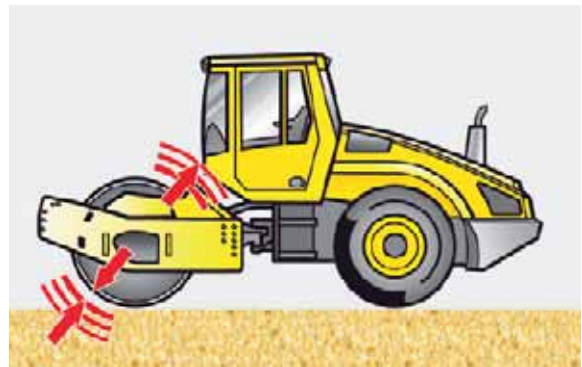
Angle = adjusted compaction energy.