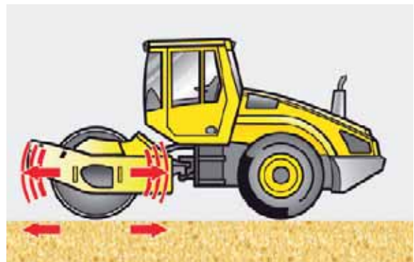
Horizontal direction = minimum compaction energy = surface compaction.