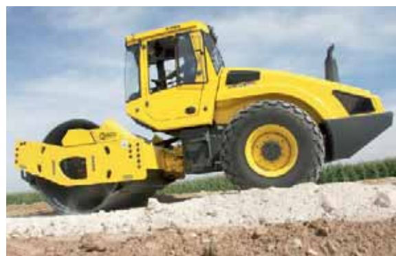
BW 213 DH BVC.