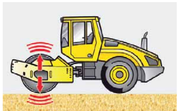
Vertical direction = maximum compaction energy = increased depth effect.