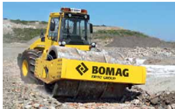
BW 332 DI BVC.

Minimum amplitude is automatically triggered at standstill – so sinking the roller drum in soft material is effectively prevented.